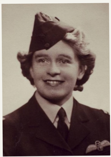
Maidenhead Heritage Centre