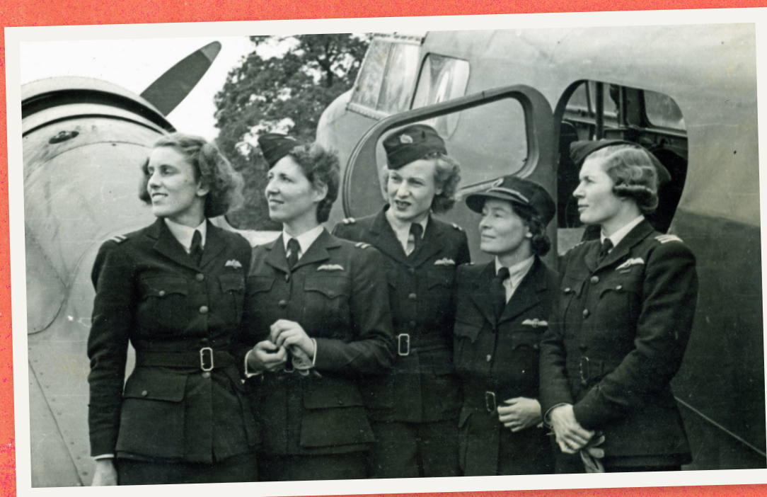
Maidenhead Heritage Centre