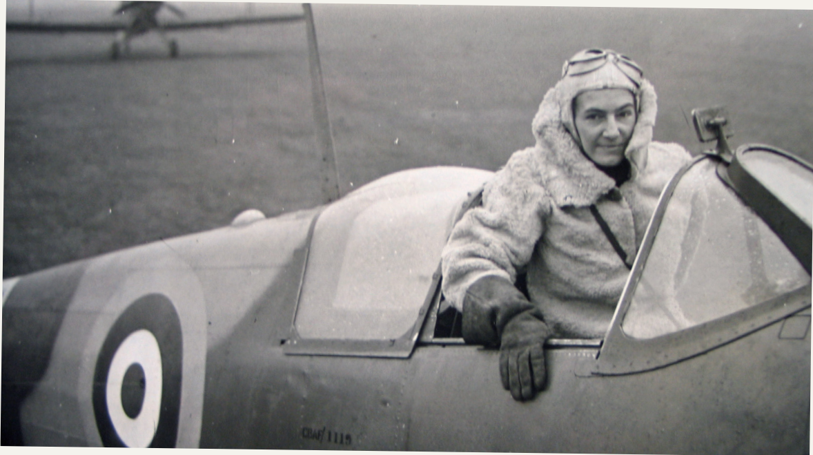
Maidenhead Heritage Centre

We are delighted to bring this new show to life and share it with audiences all over the UK. INSPIRED BY REMARKABLE TRUE EVENTS; THE WOMEN WHO DARED TO FLY.