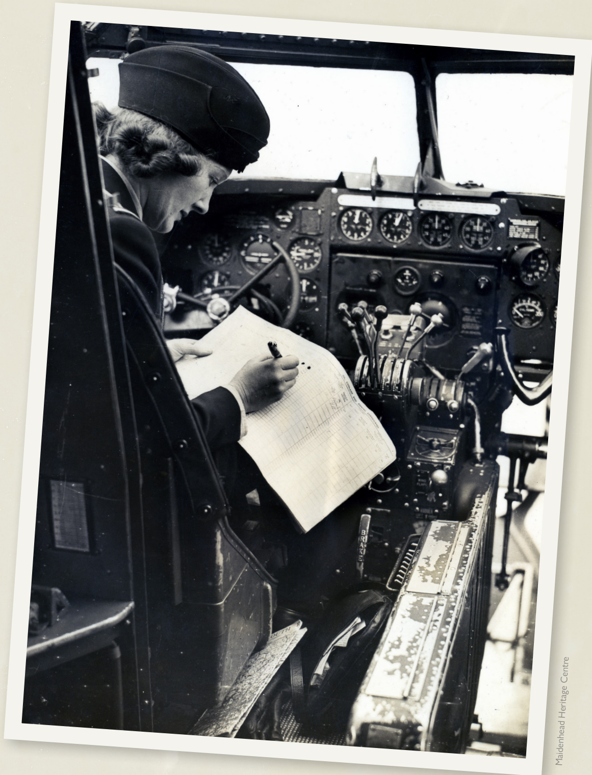
Maidenhead Heritage Centre