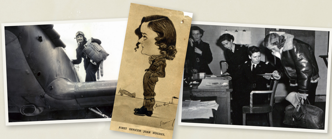
Maidenhead Heritage Centre

Cambridge IGCSE: The Cambridge IGCSE History syllabus allows students to study a self-devised depth study for coursework. This means that a student could choose to focus on the ATA for their coursework.