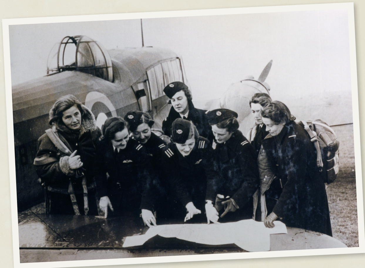
Maidenhead Heritage Centre

ACT 2 takes a darker turn as the realities of war hit home. The sisters grapple with loss and trauma, particularly Dotty, who is deeply affected by Tom's death in combat. The play explores themes of grief, resilience, and the complexities of sisterhood. It also touches upon the lasting impact of war on those who served, and the challenges they face in reintegrating into civilian life. The play ends in 1960, back at The Spitfire pub, leaving the audience to contemplate the sisters' journey and their enduring bond.