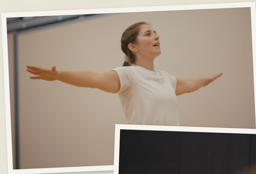
Stills from development week at National Theatre Studio, 2024